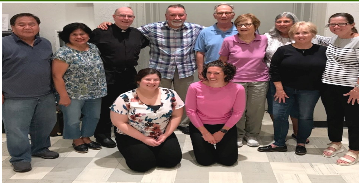
Gift of Life Family House ♥ "Home Cook Heroes" from Saint Augustine Parish

St. Augustine Parish is an open, diverse, and active Roman Catholic community rooted in the Gospel of Jesus Christ and founded in the Augustinian Tradition. We invite all to participate in our worship, service to others, and our faith development. These endeavors allow us to grow in the knowledge of God present in ourselves and each other. Our community joyfully welcomes all who are searching for a spiritual center to call home.