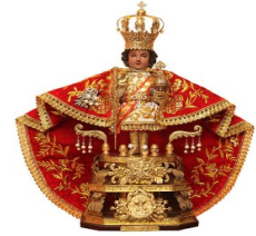
National Shrine of Santo Niño de Cebú

St. Augustine Parish is an open, diverse, and active Roman Catholic community rooted in the Gospel of Jesus Christ and founded in the Augustinian Tradition. We invite all to participate in our worship, service to others, and our faith development. These endeavors allow us to grow in the knowledge of God present in ourselves and each other. Our community joyfully welcomes all who are searching for a spiritual center to call home.