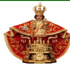
National Shrine of Santo Niño de Cebu

Served by the Augustinian Friars since 1796