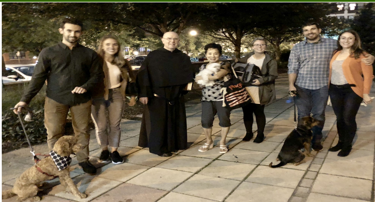
Friday, October 5, 2018 ♦ "Blessing of the Animals"

St. Augustine Parish is an open, diverse, and active Roman Catholic community rooted in the Gospel of Jesus Christ and founded in the Augustinian Tradition. We invite all to participate in our worship, service to others, and our faith development. These endeavors allow us to grow in the knowledge of God present in ourselves and each other. Our community joyfully welcomes all who are searching for a spiritual center to call home.