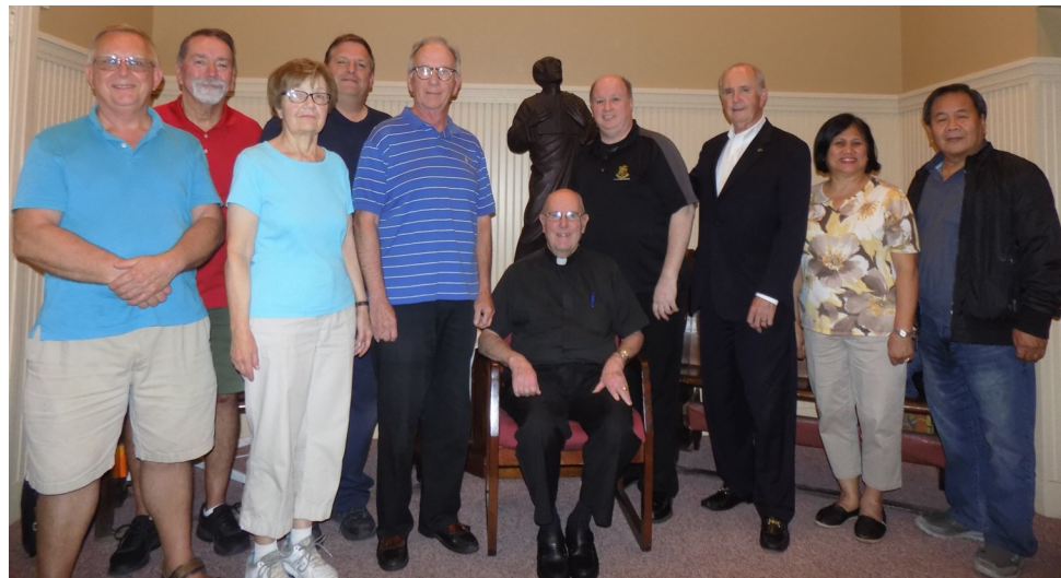
PARISH FINANCE COMMISSION, 2017-2018