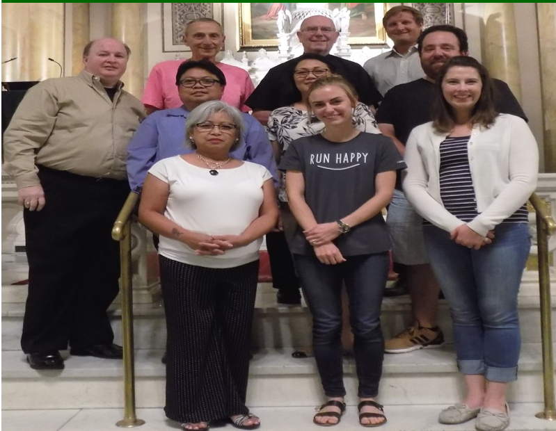
PARISH PASTORAL COUNCIL, 2017-2018

St. Augustine parish is an open, diverse, and active Roman Catholic community rooted in the Gospel of Jesus Christ and founded in the Augustinian Tradition. We invite all to participate in our worship, service to others, and our faith development. These endeavors allow us to grow in the knowledge of God present in ourselves and each other. Our community joyfully welcomes all who are searching for a spiritual center to call home.