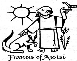
Francis of Assisi