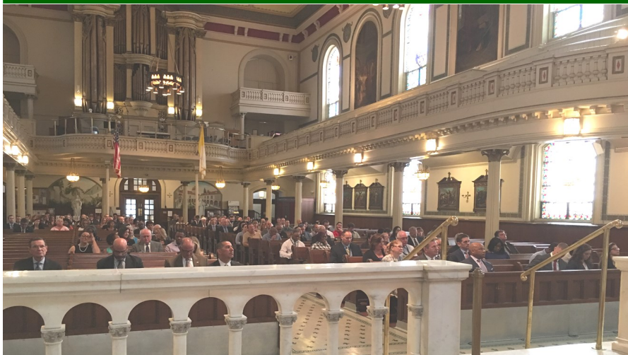
Above: Members of the FBI and DEA at a Prayer Service here at St. Augustine's.

St. Augustine parish is an open, diverse, and active Roman Catholic community rooted in the Gospel of Jesus Christ and founded in the Augustinian Tradition. We invite all to participate in our worship, service to others, and our faith development. These endeavors allow us to grow in the knowledge of God present in ourselves and each other. Our community joyfully welcomes all who are searching for a spiritual center to call home.