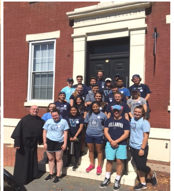
Students from Villanova who were at the parish to provide service.