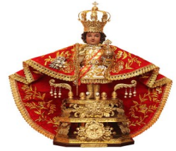
National Shrine of Santo Niño de Cebú

Served by the Augustinian Friars since 1796