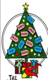
THE GIVING TREE

This coming Holiday Season we have a new organization to add to our tree, the Franciscan Outreach Program . We will be assisting 70 families this year providing clothing and a toy for each child. We will also be assisting the Bethesda Project, Augustinian Children's Orphanage in Tagaytay City Philippines, Adeodatus Prison Ministry, Family House NOW, The Gift of Life, and Woman Of Hope.