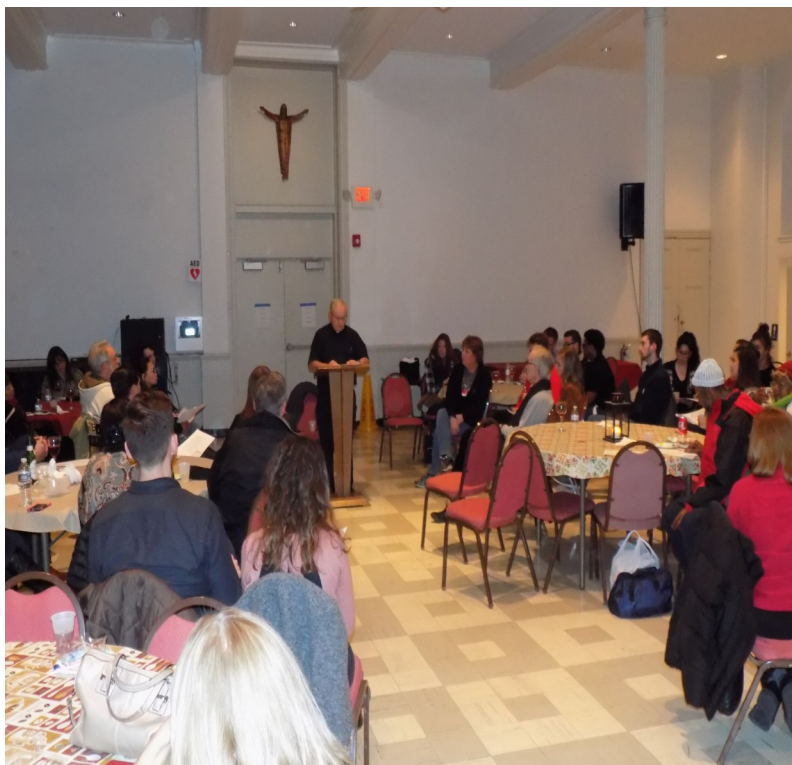
Theology on Tap ♦ Sunday, November 12th ♦ Exorcism Discussion