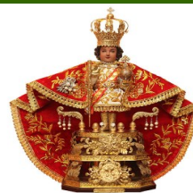
National Shrine of

"Creating A Community Of Involvement And Evangelization"