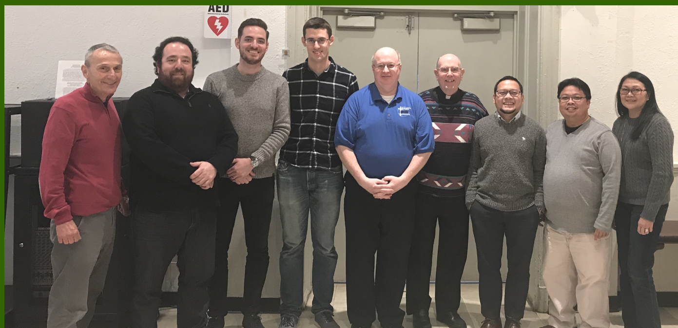
2018-2019 Parish Pastoral Council

St. Augustine Parish is an open, diverse, and active Roman Catholic community rooted in the Gospel of Jesus Christ and founded in the Augustinian Tradition. We invite all to participate in our worship, service to others, and our faith development. These endeavors allow us to grow in the knowledge of God present in ourselves and each other. Our community joyfully welcomes all who are searching for a spiritual center to call home.