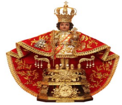
National Shrine of Santo Niño de Cebu

Served by the Augustinian Friars since 1796