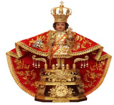
National Shrine of Santo Niño de Cebú

"Creating A Community Of Involvement And Evangelization"