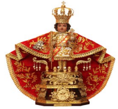
National Shrine of Santo Niño de Cebú

Served by the Augustinian Friars since 1796