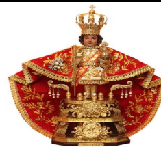
National Shrine of Santo Niño de Cebú

Served by the Augustinian Friars since 1796