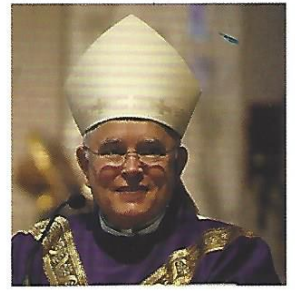
Archbishop Charles J. Chaput Archbishop of Philadelphia. Mass celebrant