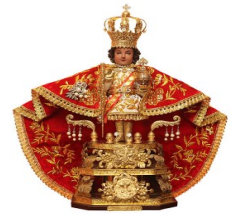
National Shrine of Santo Niño de Cebu

Served by the Augustinian Friars since 1796