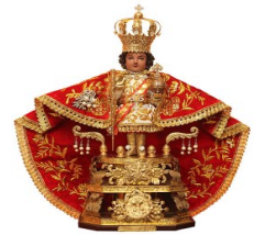
National Shrine of Santo Niño de Cebú

Served by the Augustinian Friars since 1796