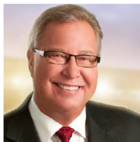
Ron Jaworski Philadelphia Eagles beloved quarterback of Superbowl XV, NFL TV and radio analyst. Owner of Philadelphia Soul .