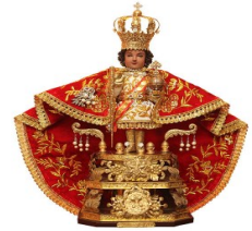
National Shrine of Santo Niño de Cebú

Served by the Augustinian Friars since 1796