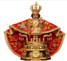
National Shrine of Santo Niño de Cebú

Served by the Augustinian Friars since 1796