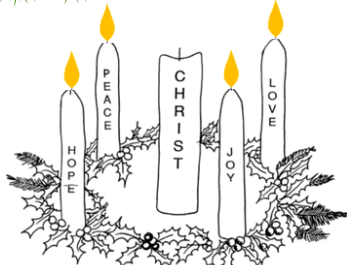
Fourth Sunday of Advent – Peace