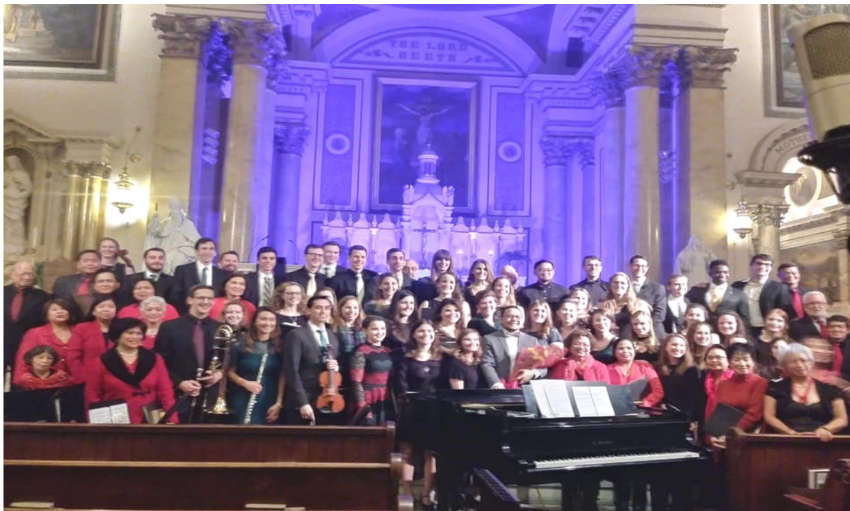
Pre-Christmas Concert ♦ Friday Evening, December 7, 2018