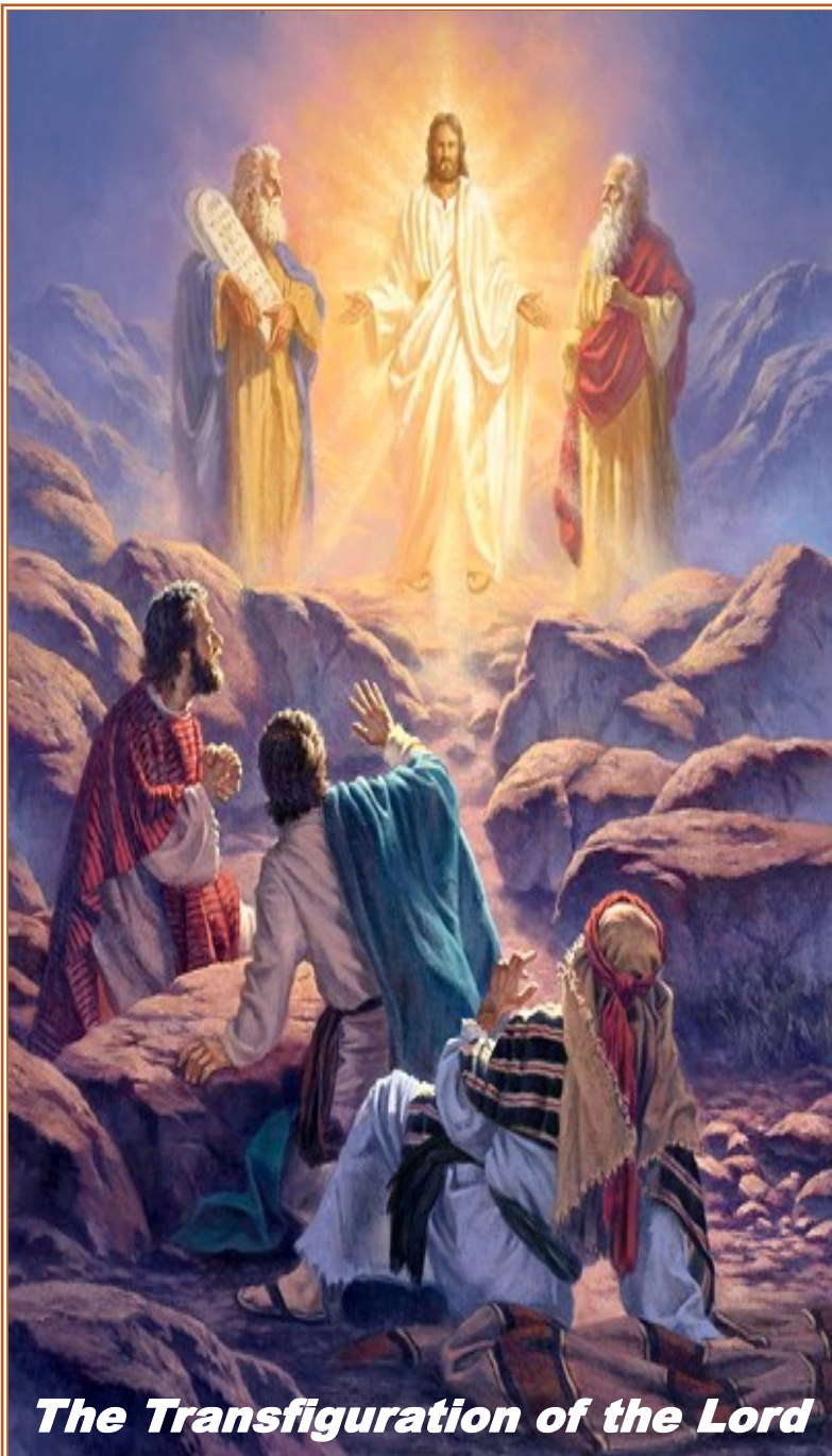
The Transfiguration of the Lord